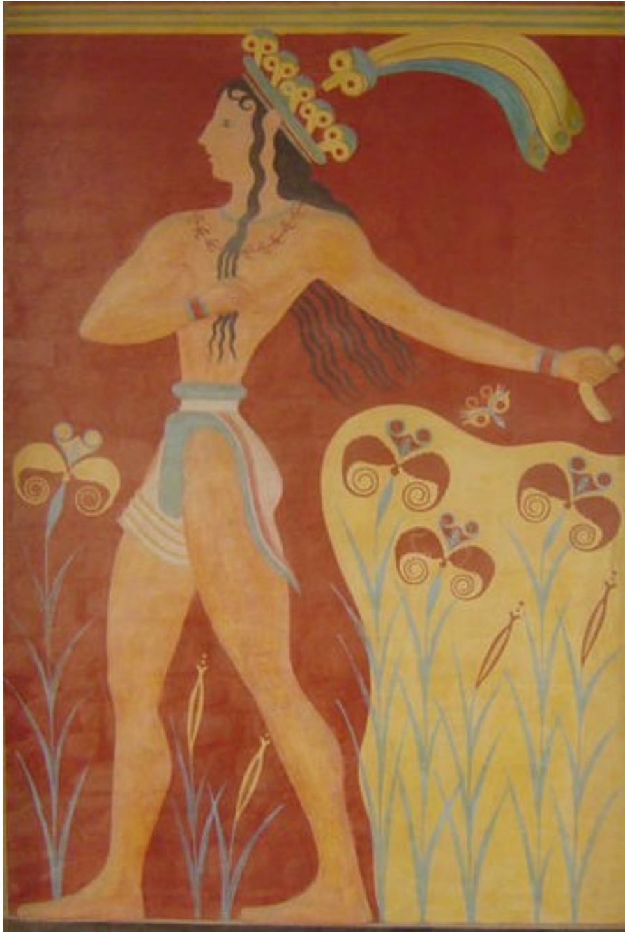
Fig.3 "The Prince of Lilies" (Knossos, Crete, c.1690 BC)