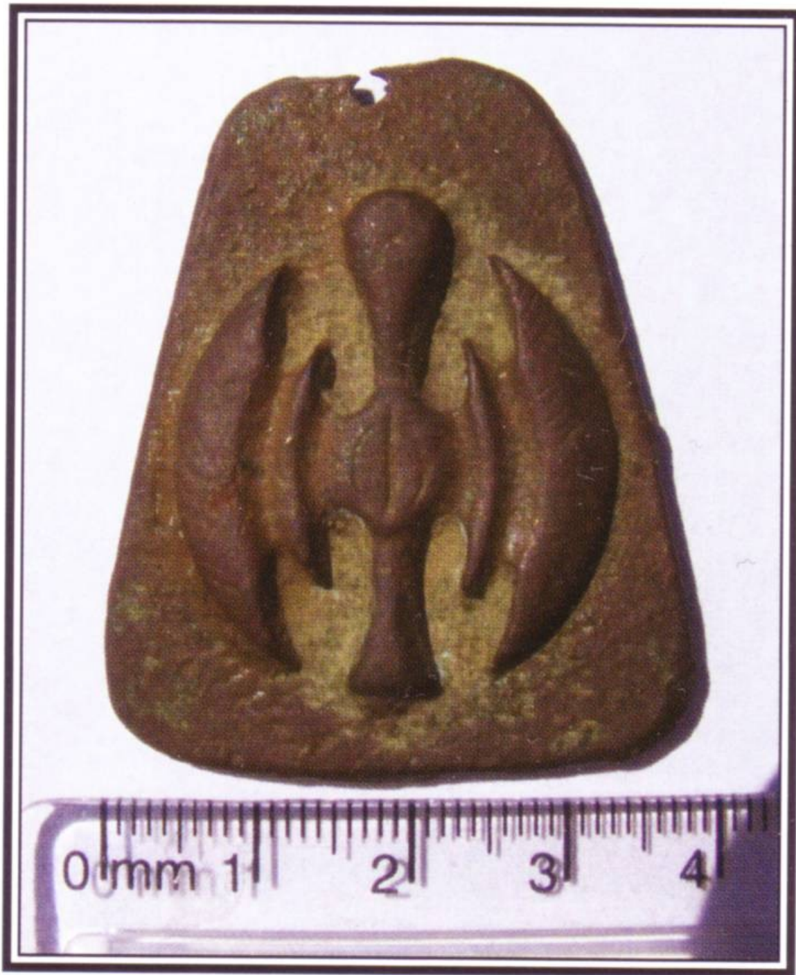
Fig.2 The back side of the Minoan Pendant. (Cleveland, Ohio, c.1690 BC) (Courtesy Ancient American, Vol.13, No.83)