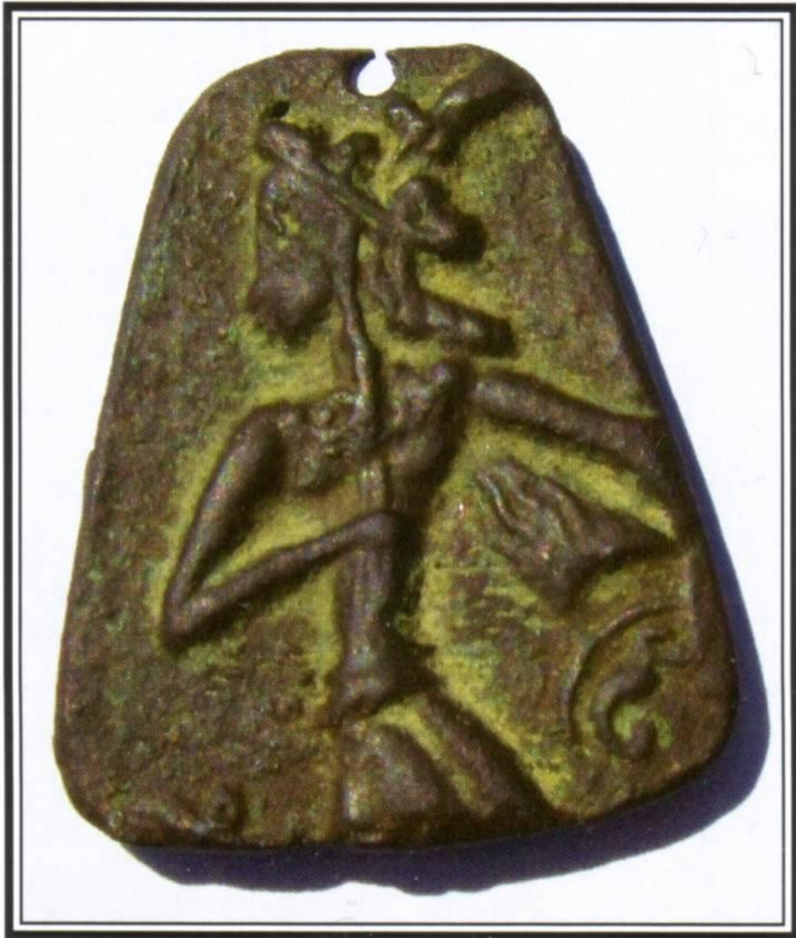
Fig.1 The front side of the Minoan Pendant. (Cleveland, Ohio, c.1690 BC)

The religious features of this pendant are so prominent, that it is for sure that the artifact was made in one of the main religious centers on Crete, Knossos or Phaistos. Because of the close resemblance with the 'Prince of Lilies' (fig.3), Knossos is the most obvious place (Refs.27,-28).